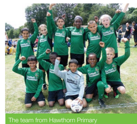
The team from Hawthorn Primary