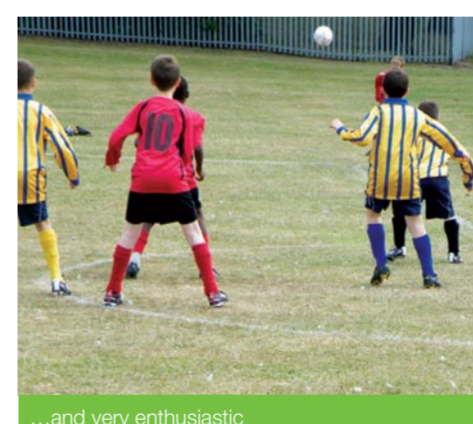
...and very enthusiastic