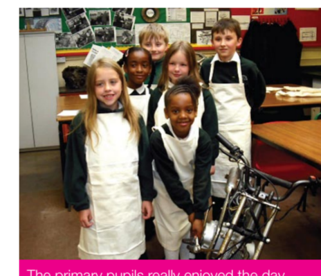
The primary pupils really enjoyed the day

Pupils had a fantastic time and thoroughly enjoyed the workshops which have most definitely produced some budding technology experts – possibly with green fingers! Further plans are in the making for future exciting projects where brains and resources can be shared.