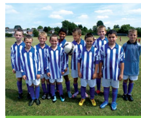
Teams from all over Birmingham attended

In July, eight teams from local primary schools travelled to North Birmingham Academy for the Kingstanding Extended Services Partnership Football Tournament. All the matches were keenly contested with North Birmingham Academy students on hand to ensure the tournament ran smoothly. Year 7, 8 and 9 assisted referees as ball boys and girls, while post-16 students acted as ambassadors for parents. Against a backdrop of sunny skies and the flags of the World Cup, the primary school children showed off their talents in some high quality matches with the team from Sundridge Primary coming out as eventual winners.