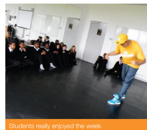
Students really enjoyed the week