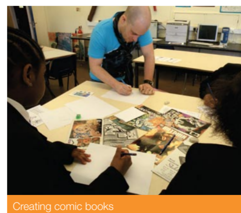
Creating comic books