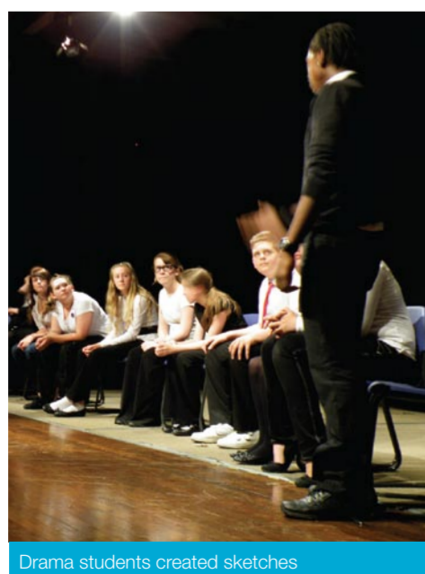
Drama students created sketches