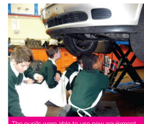
The pupils were able to use new equipment