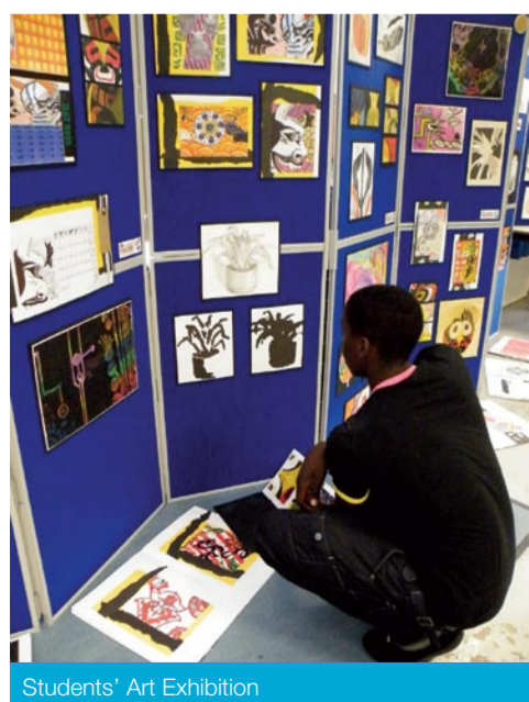
Students' Art Exhibition

The imaginative project demonstrated the benefits of North Birmingham Academy's specialist status in the Arts which encourages students to think more creatively and develops their confidence.