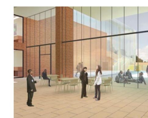
How the Academy might look