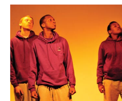
Students performed a dance routine for the guests