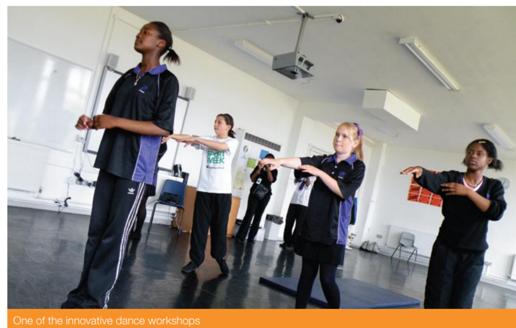
One of the innovative dance workshops

In June, Year 7 students had the opportunity to work with the Round Midnight Theatre Company in four workshops: drama, art, music and dance. Each workshop looked at a skill required in the world of work, such as group work, speaking in public and working to deadlines. The drama workshop looked at developing presentations for selling a product while music was used to create ringtones. In the art session, students developed a comic book and in dance they worked on a hip-hop dance routine. At the end of the week, students watched a DVD that showcased the work they had produced during the project. Thank you to the Round Midnight Theatre Company and their artists.