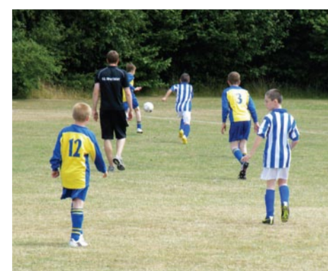
They were all smart in their school kits...