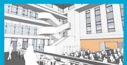
Artist's impressions of the new building